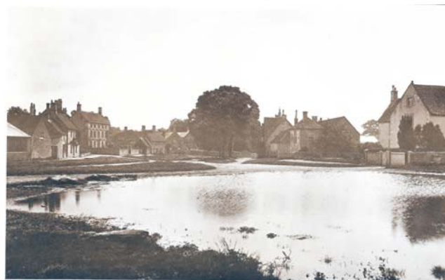
Biddestone Village 1907